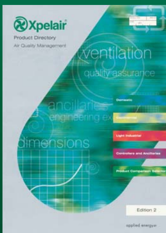
Xpelair Product Directory