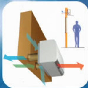
High level installation

The new Unico a revolutionary all-in-one air conditioning system providing immediate, individual climate control.