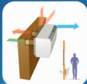
Low level installation

The Unico can be fitted at high or low level in both cooling and heat pump mode